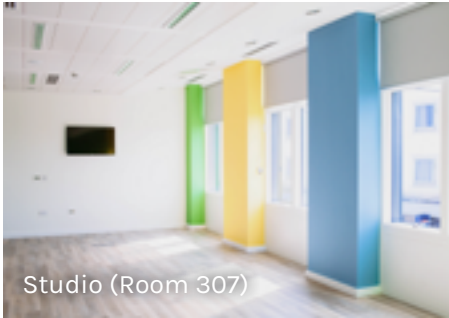
Studio (Room 307)