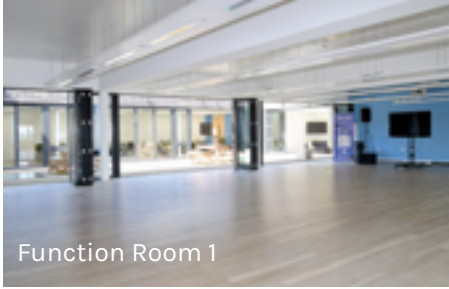
Function Room 1